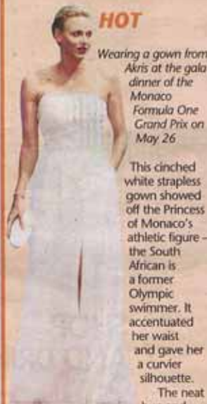
Wearing a gown from Akris at the gala dinner of the Monaco Formula One Grand Prix on May 26.

This cinched white strapless gown showed off the Princess of Monaco's athletic figure – the South African is a former Olympic swimmer. It accentuated her waist and gave her a curvier silhouette.